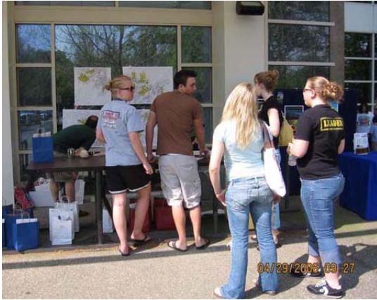
City-wide Storm Drain Marking Event Chico volunteers waiting in line for Storm drain maps and markers 4/06