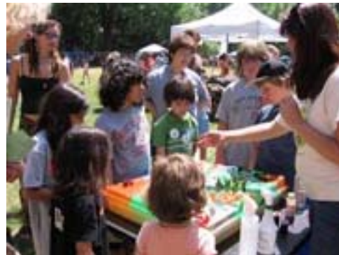
Chico USA EnviroScape Model Interactive Demonstration at the Endangered Species Faire, 2006