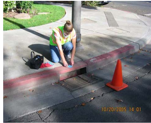
Chico Citizen marking storm- drain 4/06