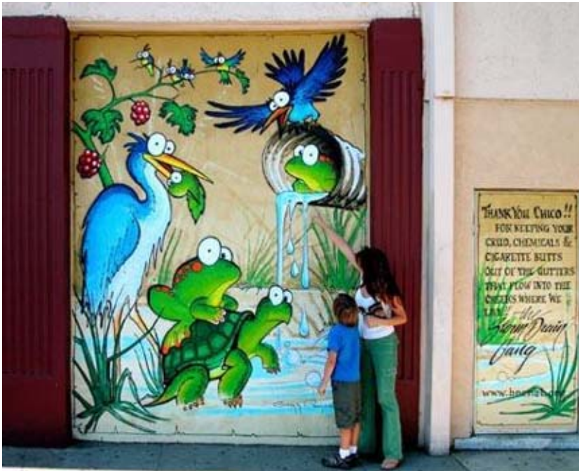
One of two Chico USA murals in downtown Chico "Storm Drain Gang I" 5/06

Rather than produce billboards, the Chico USA EOP produced two murals with the runoff pollution prevention message. The murals were designed to convey a positive message and instill public support for runoff pollution prevention efforts. The murals remain intact at both locations and were a cost-effective alternative to billboards due to the length of time that the messages and images remain in the public realm. The strategy of using murals also garnered much more press coverage, making the impacts of the message greater.