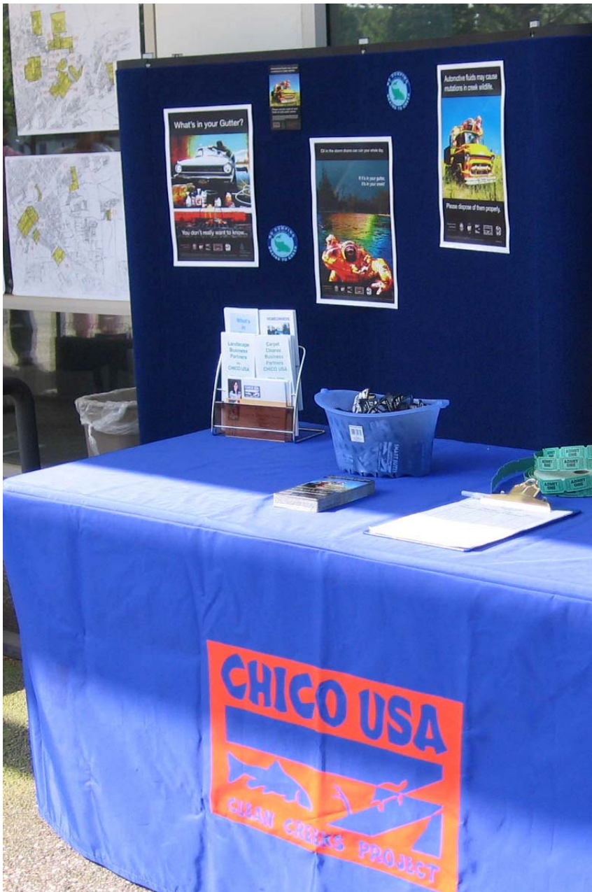
Chico USA booth and promotional materials (posters, buttons, brochures, magnets, etc.)