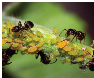
Ants are attracted to the honeydew that aphids make.

Aphids (and other plant pests including whiteflies and scale) produce a sweet, sticky substance called honeydew that attracts ants. Seeing a lot of ants on plant stems is a sure sign of a pest infestation. Since ants will actually protect honeydew-producers from natural predators, it's important to keep ants away when you're trying to get rid of aphids.