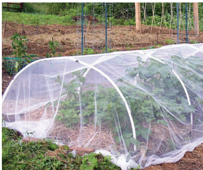
A row cover will keep aphids away from plants.